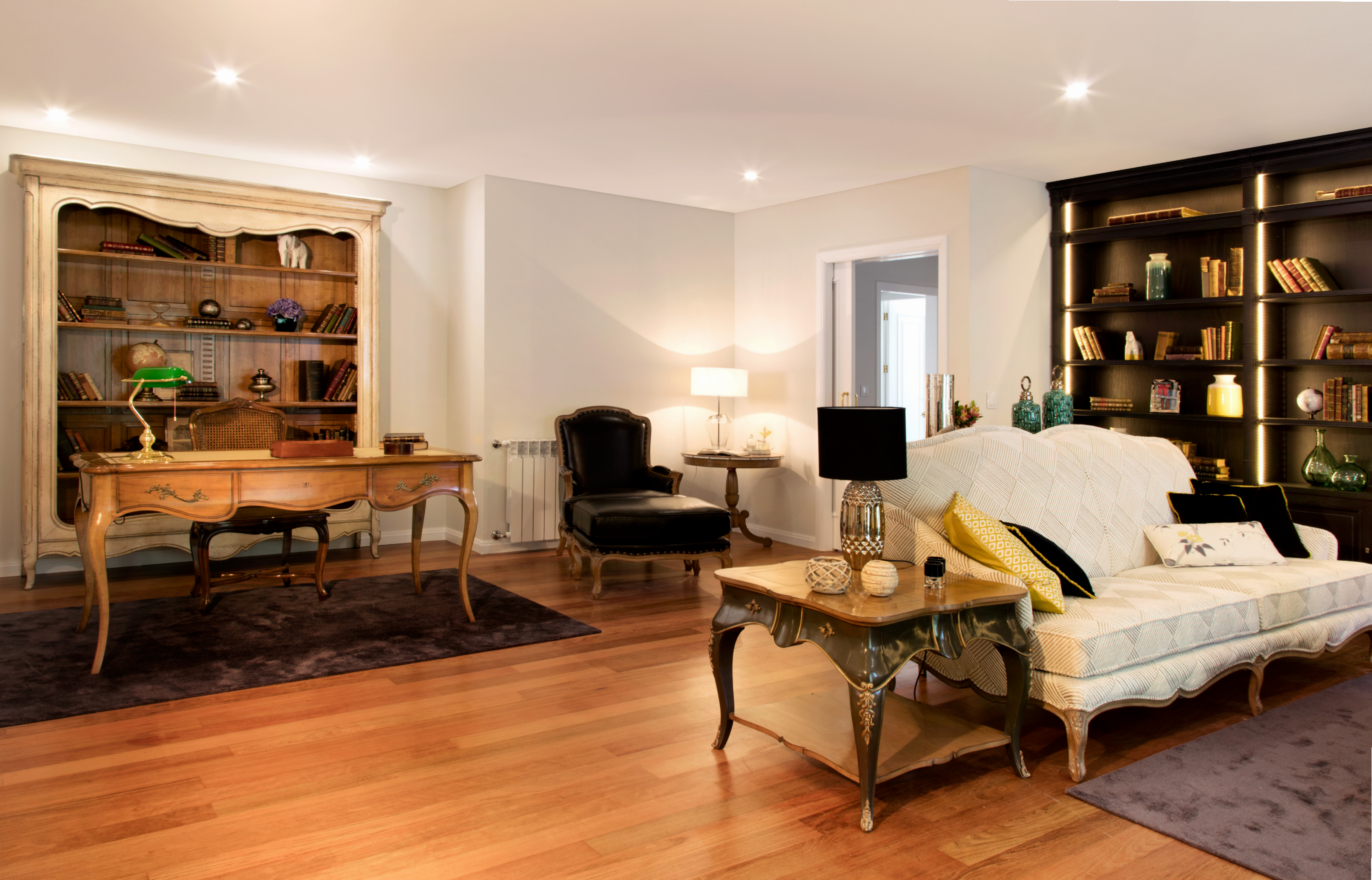
DESK DESK ARMCHAIR BOOKCASE ARMCHAIR UPHOLSTERED STOOL GUERIDON SIDE TABLE SOFA BOOKCASE AC3091 AC3110 AC3212.HD + AC3212.AHD AMD.SOF0100.P19 AMD.SOF0101.P19 17014 24068 AMD.SOF102.TC + MP.TEC.BRAVADO A201