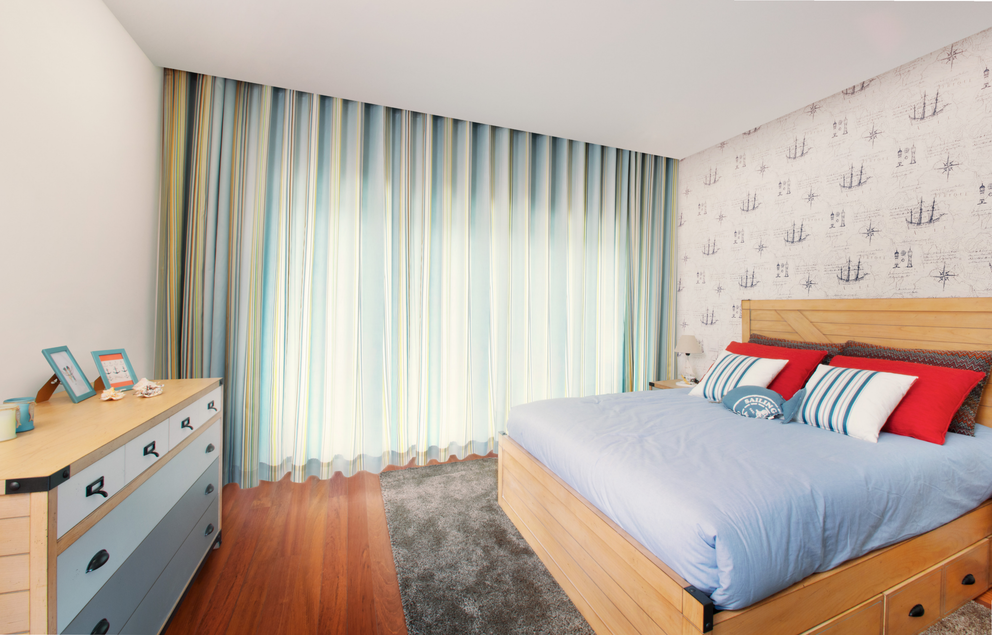
CHEST OF DRAWERS BED BEDSIDE TABLE U10024 U10001G U10034