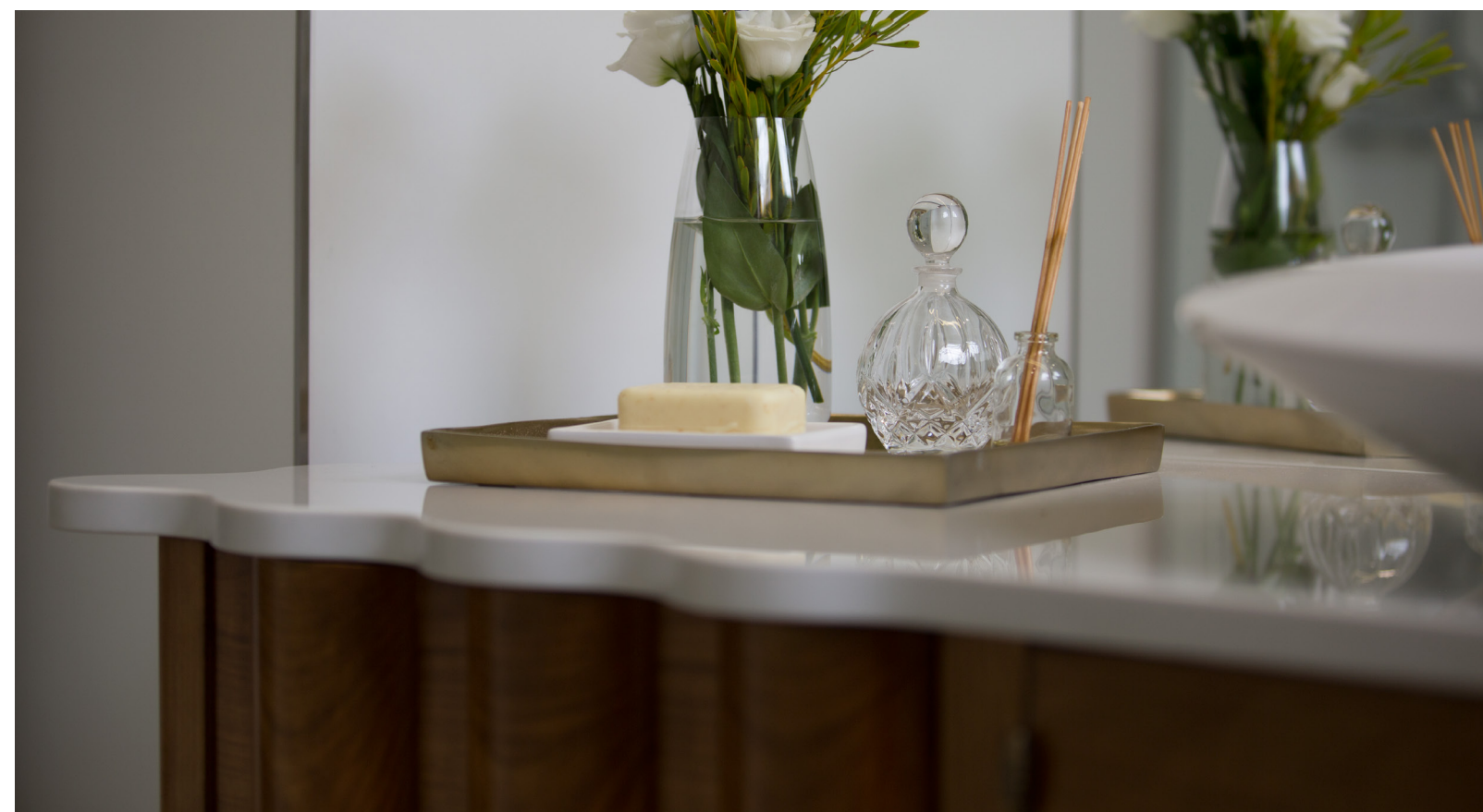
BATHROOM CABINET 28005C.TM.CARR