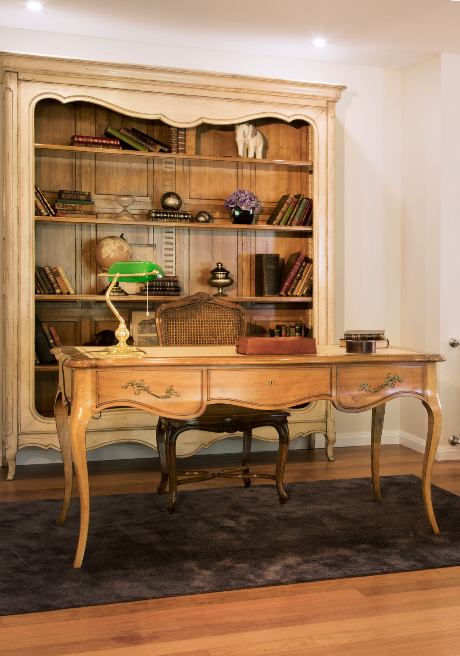
DESK DESK ARMCHAIR BOOKCASE AC3091 AC3110 AC3212.HD + AC3212.AHD