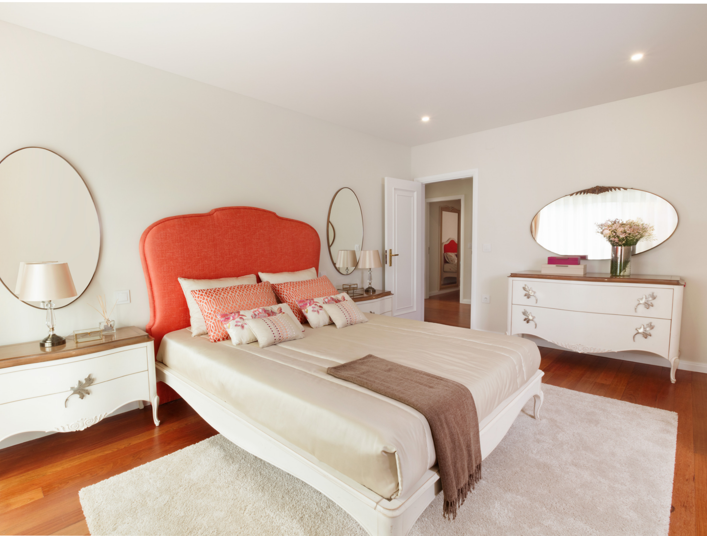
BEDSIDE TABLE 13022D.2N BED 13008.TC + MP.TEC.KEY BEDSIDE TABLE 13022E.2N MIRROR 13027ST CHEST OF DRAWERS 13023.2N MIRROR 13034