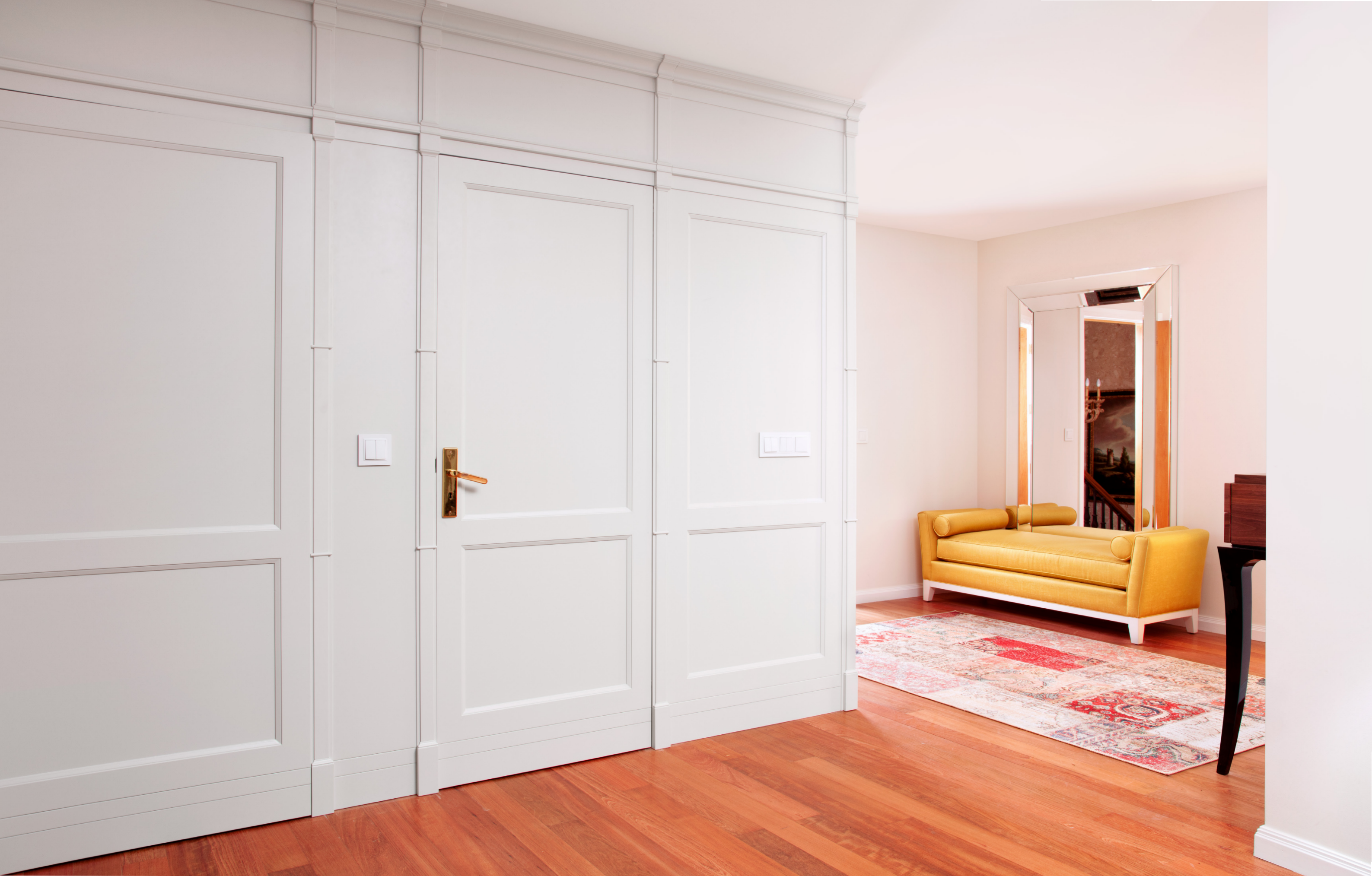
WALL PANELS SOFA BENCH MIRROR MOD.DIRECTOIRE01.C P10019LAB.TC + MP.TEC.KEY AMD.ESPELHO.420