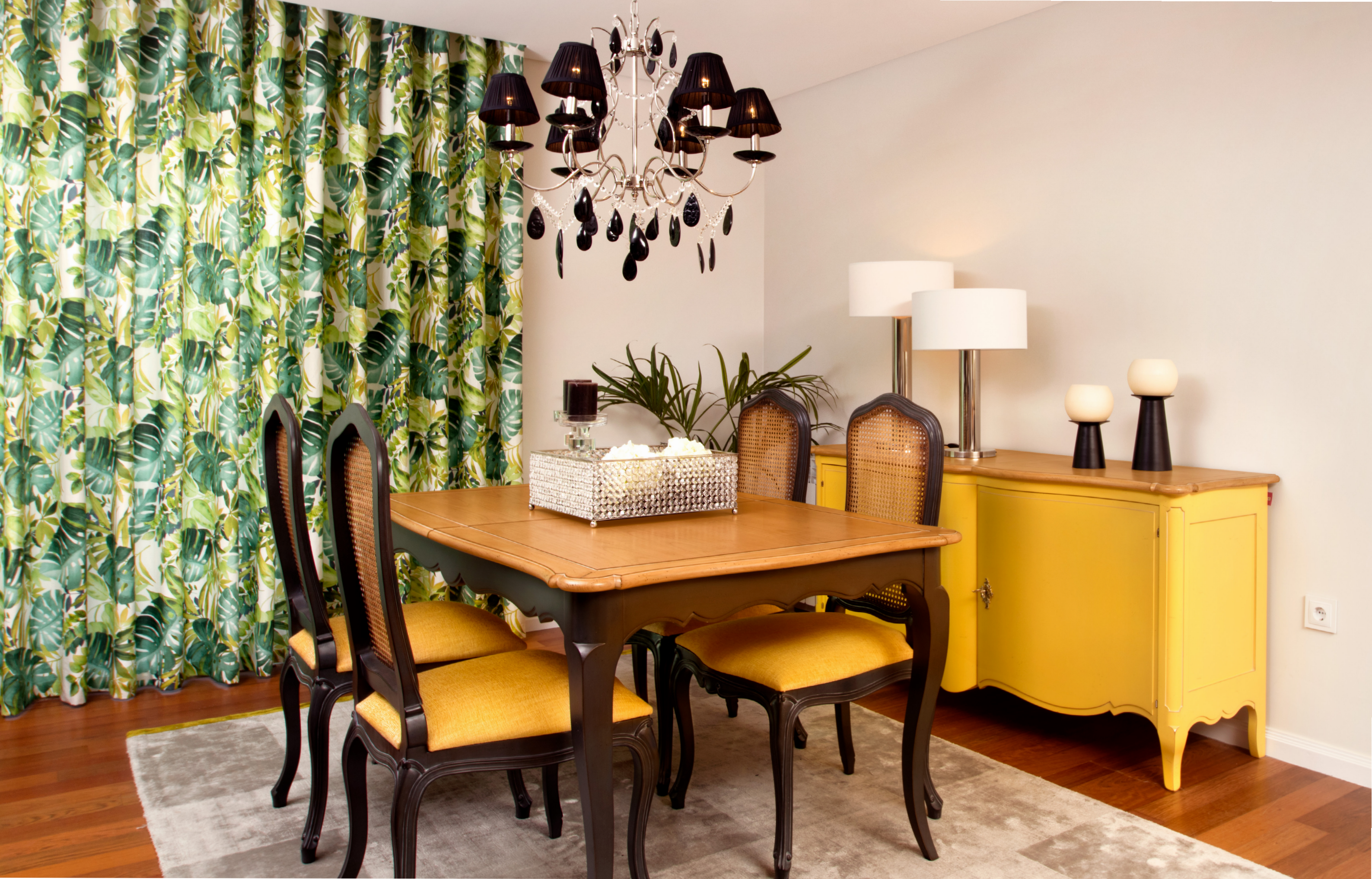
DINING TABLE CHAIR SIDEBOARD AC6174 AC3330.TC + MP.TEC.BRONCO2 AC6170.1