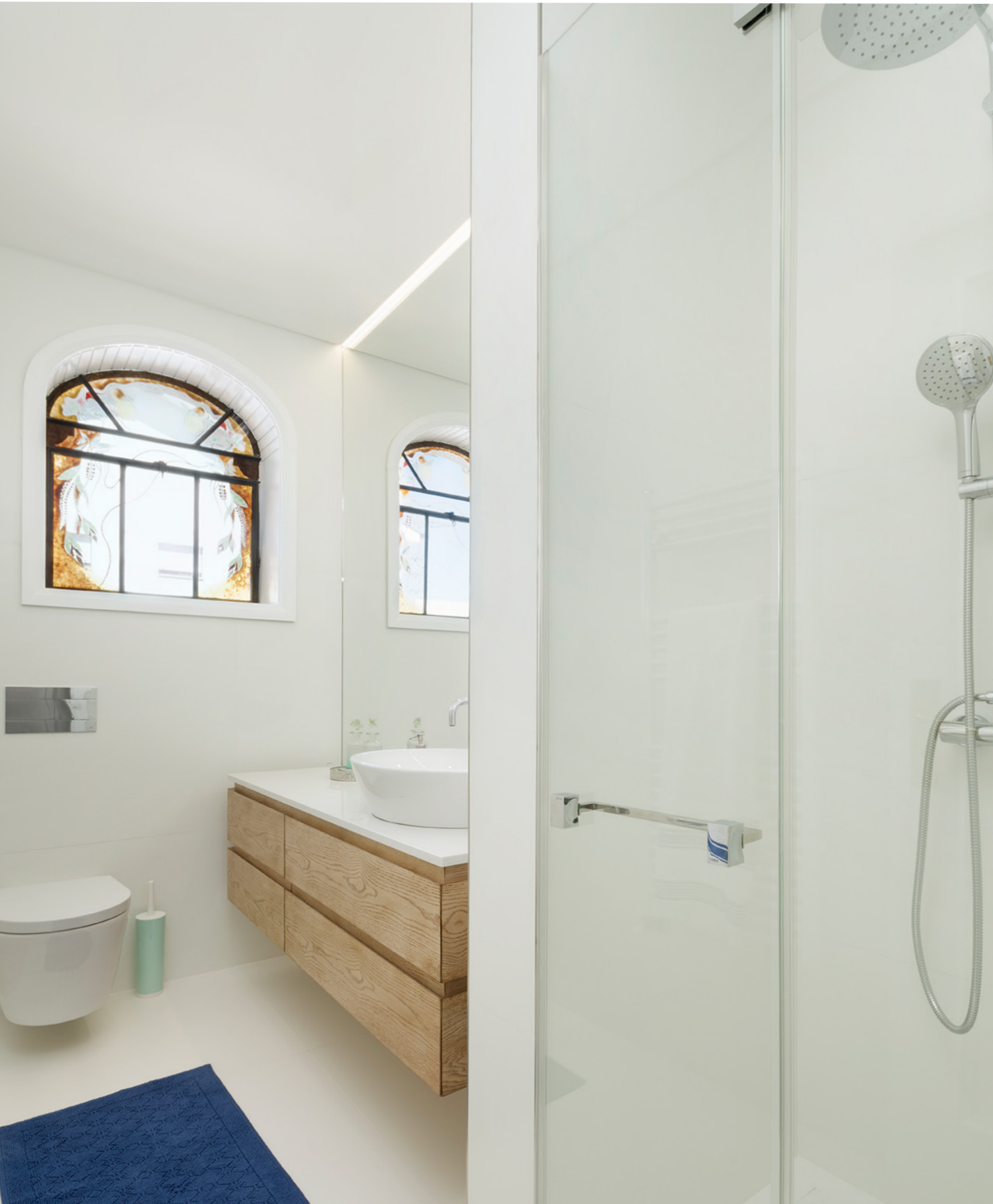
BATHROOM CABINET 28030.TM.CARR BATHROOM CABINET AC3093C.TM.XGLOSS