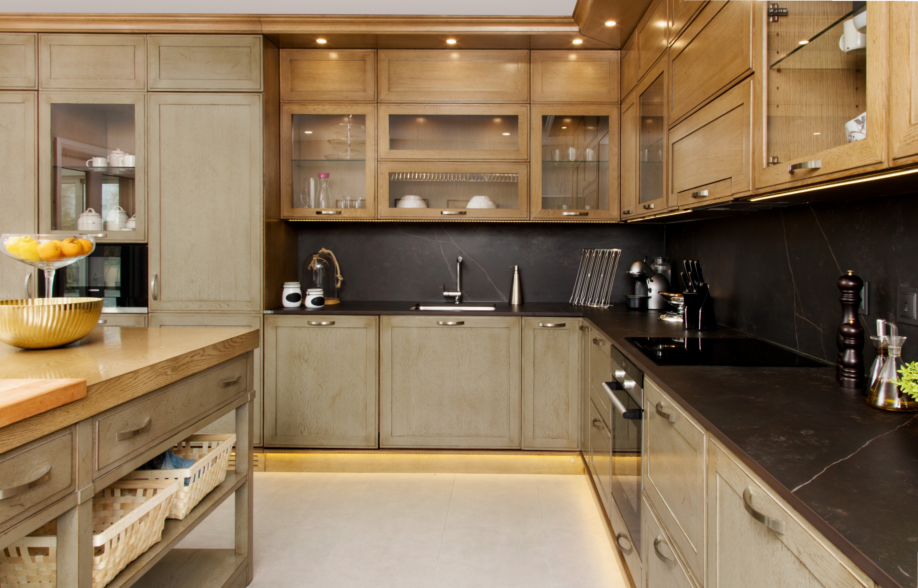
KITCHEN COUNTERTOP KITCHEN E.ILHA MOD.ENEIDAC0Z01.CA