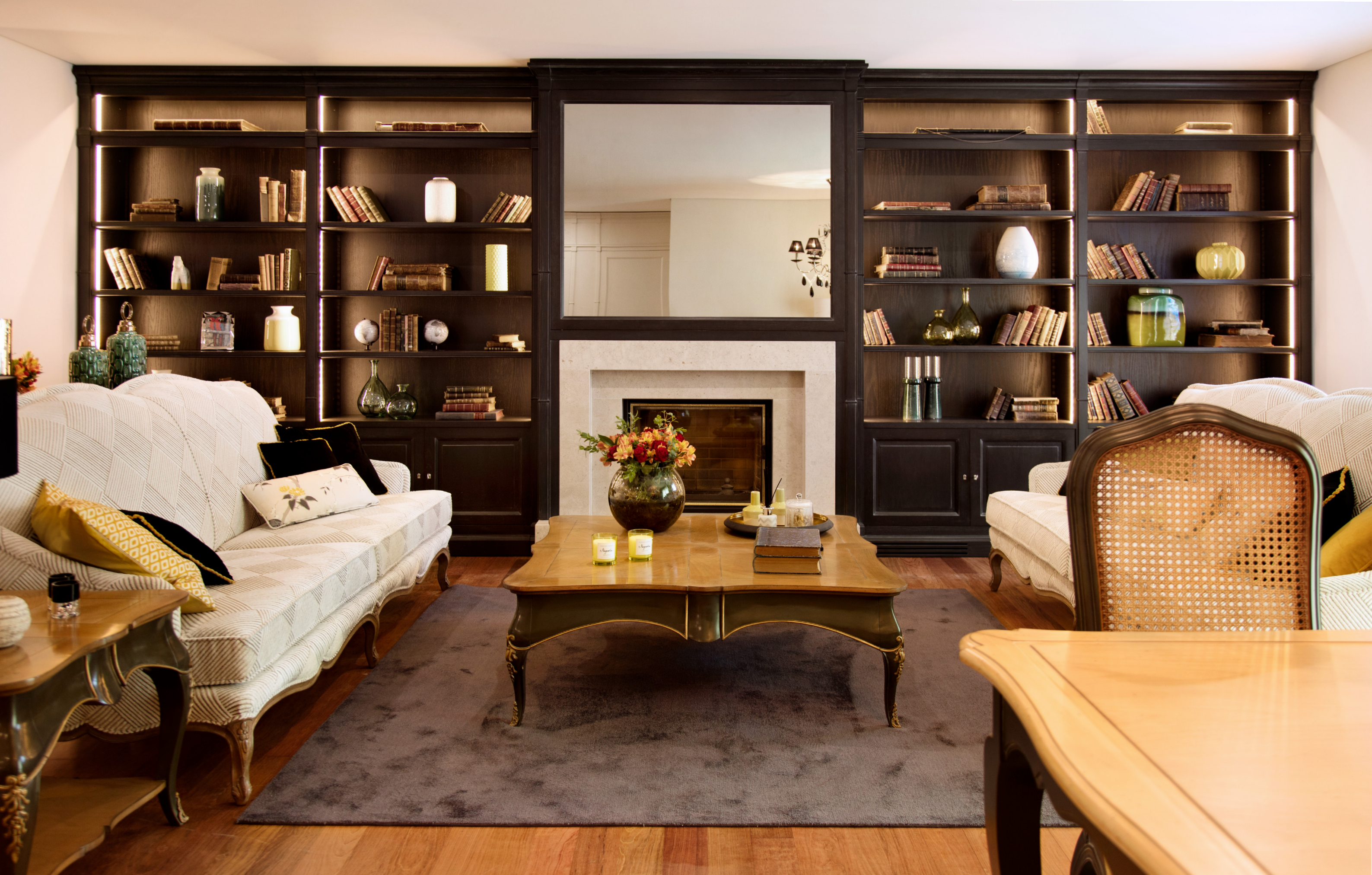
SIDE TABLE SOFA BOOKCASE COFFEE TABLE DINNING TABLE CHAIR 24068 AMD.SOF102.TC A201 24067 AC6174 AC3330.TC + MP.TEC.BRAVADO + MP.TEC.BRONCO2