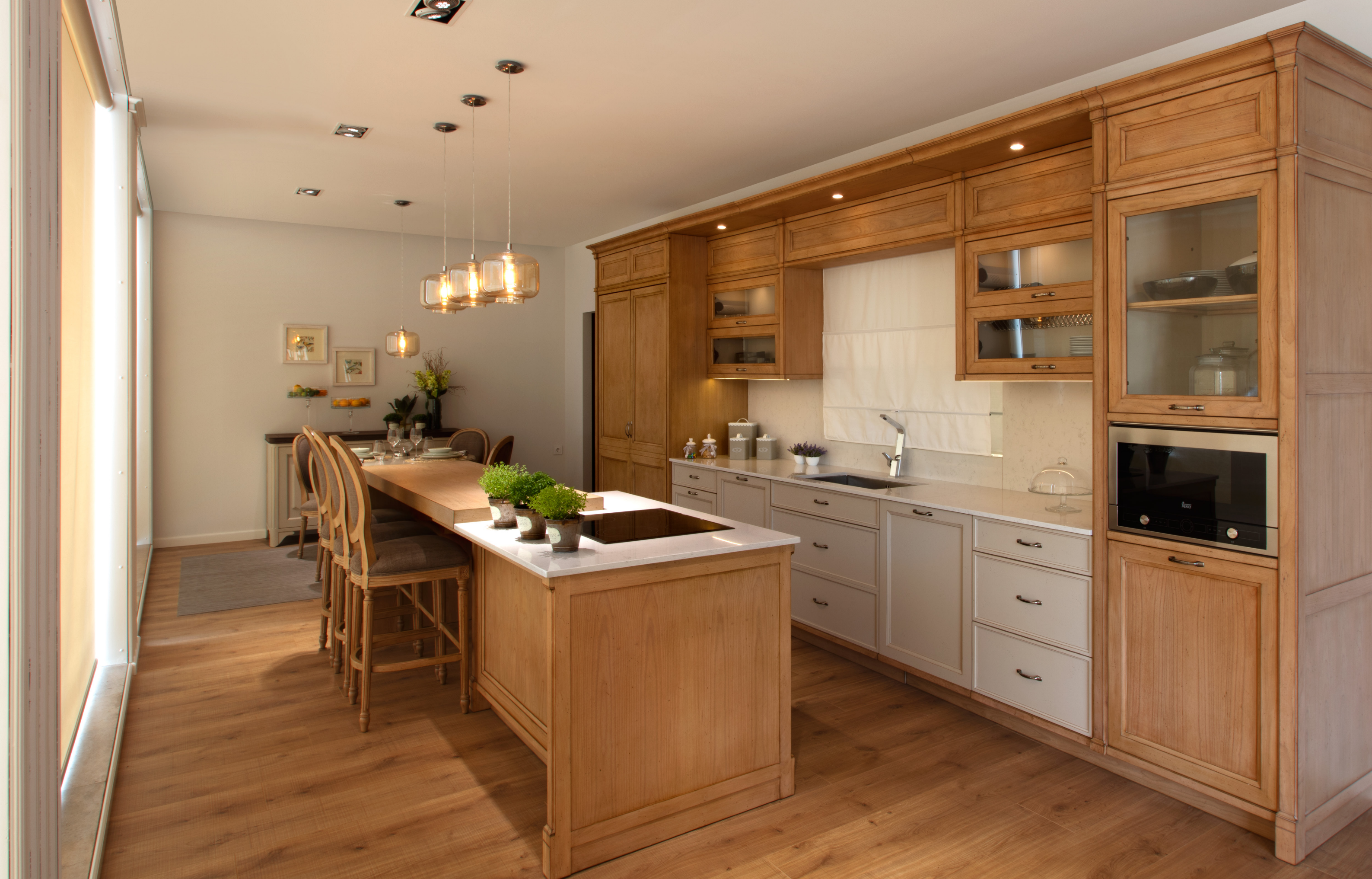
KITCHEN COUNTERTOP DIRECTOIRE #4