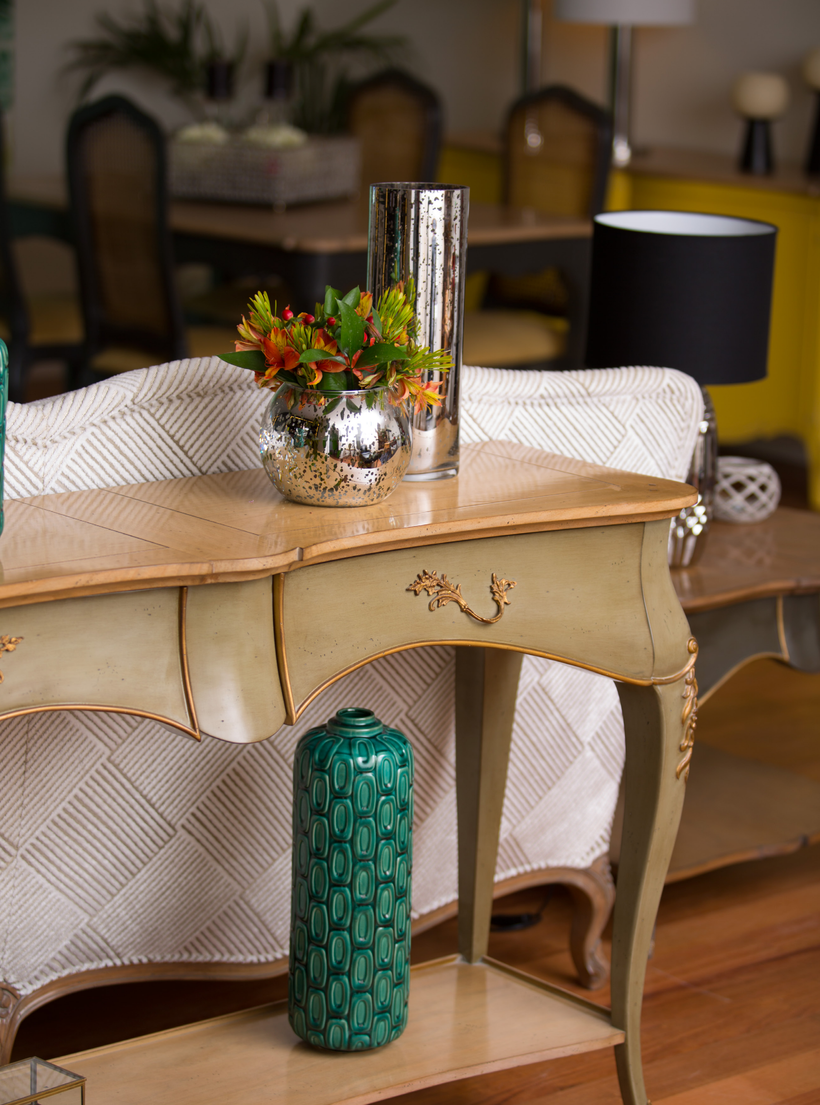
CONSOLE 24070 COFFEE TABLE 24067